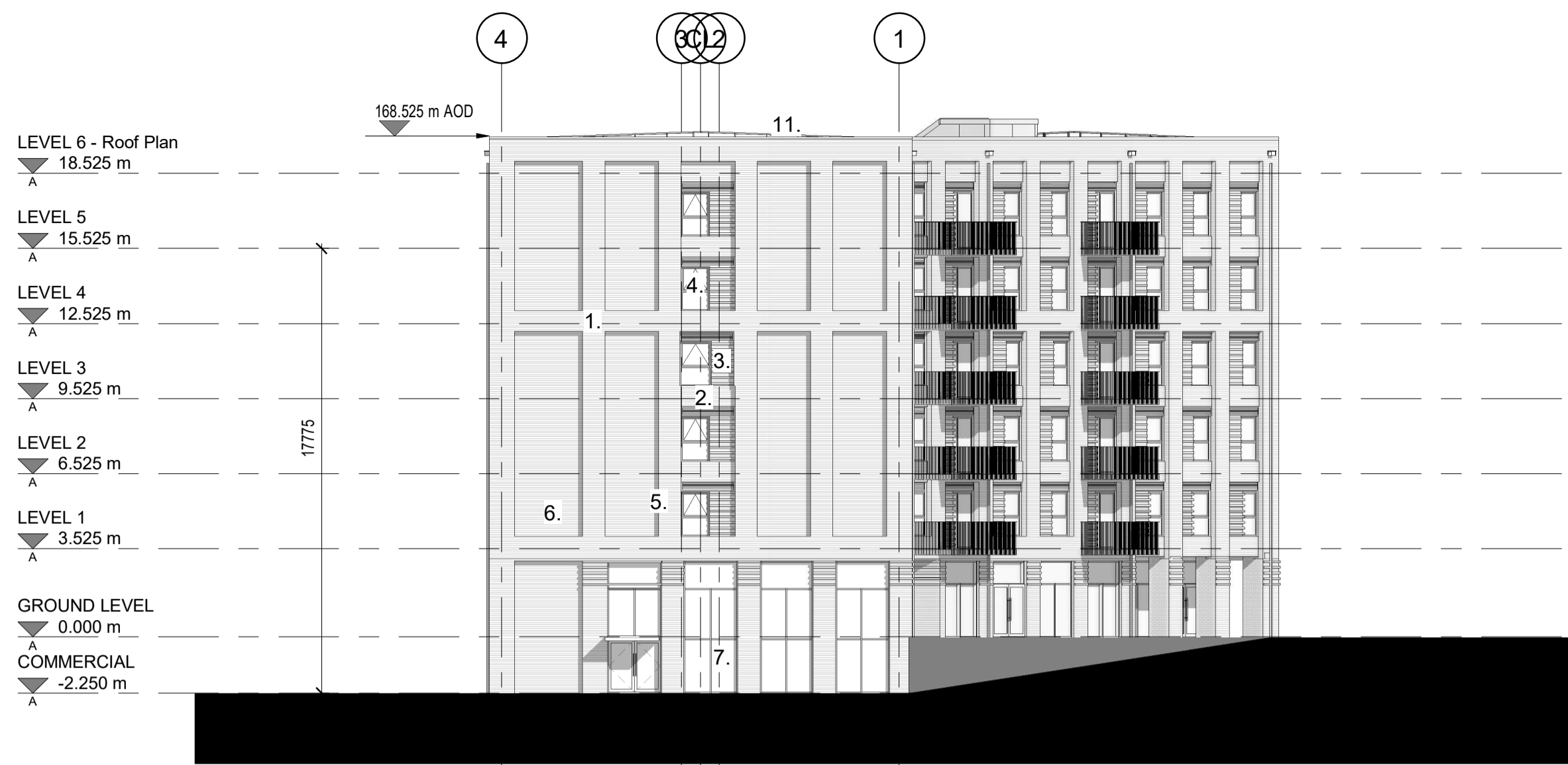
1 NORTH ELEVATION BW 1 : 200