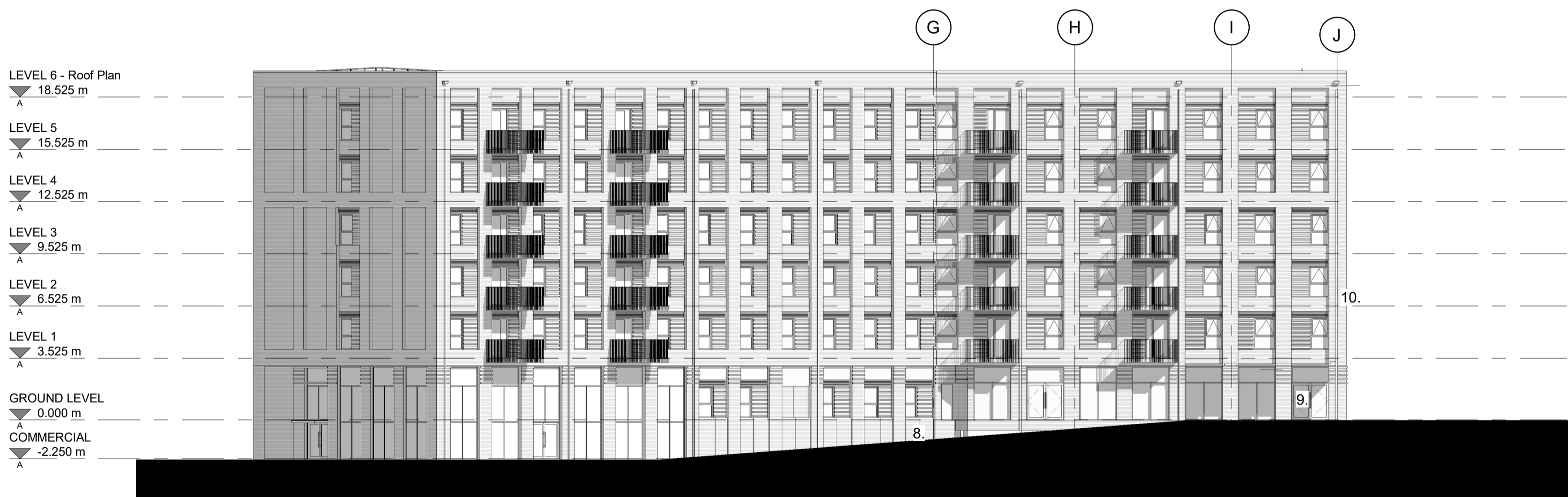
3 NORTHWEST ELEVATION BW 1 : 200