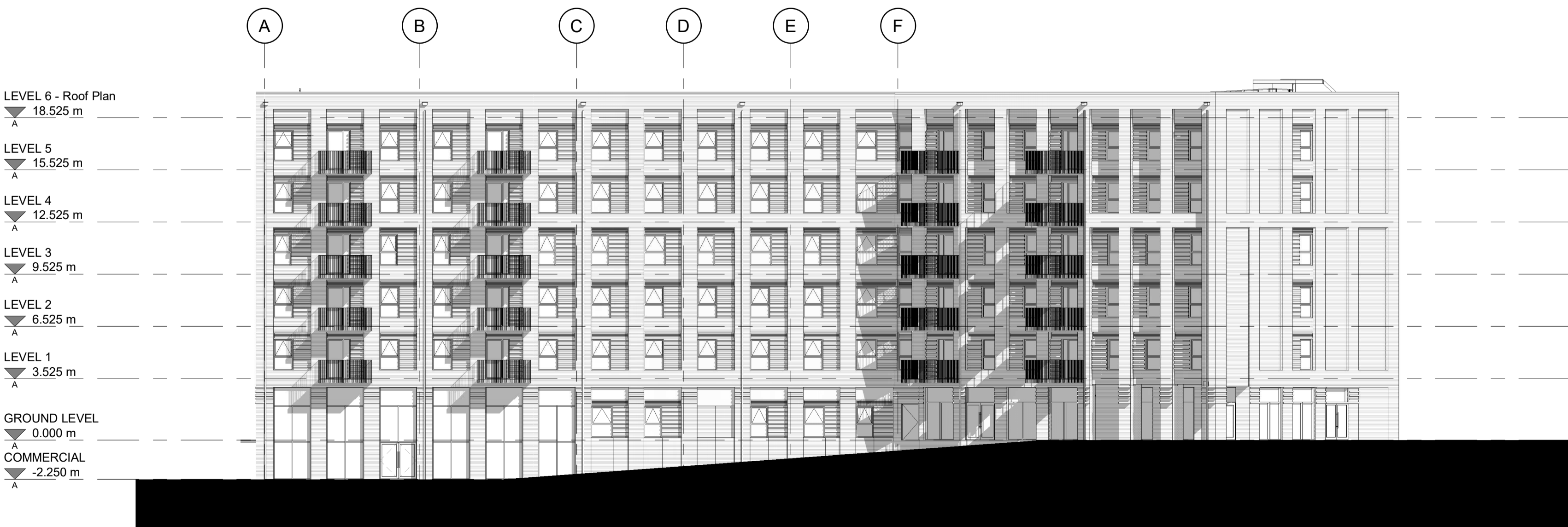
2 WEST ELEVATION BW 1 : 200